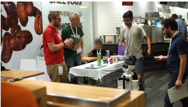
Figure 2: Restaurant Task from the 2018 competition.

Standard Platform League (DSPL), which uses the Toyota Human Support Robot (HSR), as seen in Figure 3a.