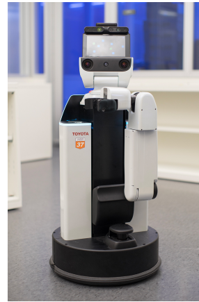
(a) Toyota HSR.

Stage II tasks include Enhanced Endurance General Purpose Service Robot (EEGPSR), a longer version of GPSR with more complex commands which may contain incomplete or false information; Procter & Gamble Dishwasher Challenge , where the robot cleans a table and loads dishes into a dishwasher; and Restaurant where patrons call to the robot, which takes orders and goes to a bar area to fulfill them. The task is hosted in a real restaurant. In 2018, restaurant was the coffee shop at the convention center, seen in Figure 2.