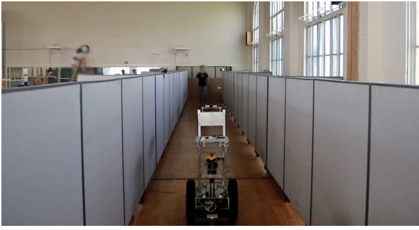
Figure 4: Constructed hallway environment with robot and participant in the early stage of hallway traversal.

map; a pose estimator, which estimates their pose to be annotated on the map; and an extractor, which extracts semantic information to be annotated.