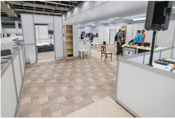
Figure 1: RoboCup@Home Arena for the Domestic Standard Platform League in the 2018 competition in Montreal.