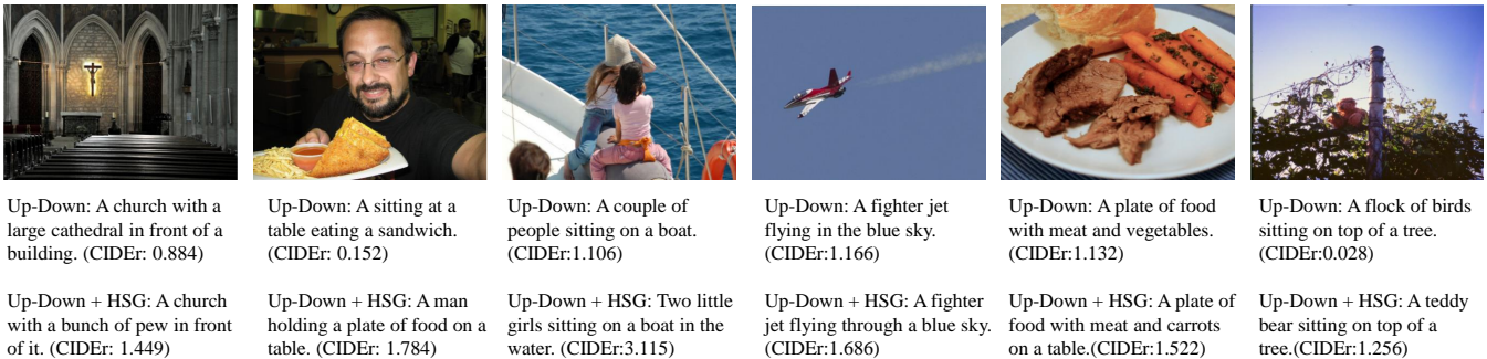
Figure 4: Sampled generated captions using Up-Down decoders with and without HSG. The captions are sampled using beam search with a beam size of 5.

ordered and we asked workers to rank them in terms of descriptiveness, allowing for ties. We test each image with two captions with 3 different judges and the final rankings are determined as follows. For each human judgement, we assign +1 to the better caption, 0 if they are tied and -1 to the worse one. Then, we compute the average scores for the two captions to decide their final rankings. In Table 5, we report the percentage of our captions that are better than, equivalent to, or worse than the captions without HSG. We observe that our captions are better more than 50% of the time and worse less than 30%, indicating that HSG is effective at improving captioning.