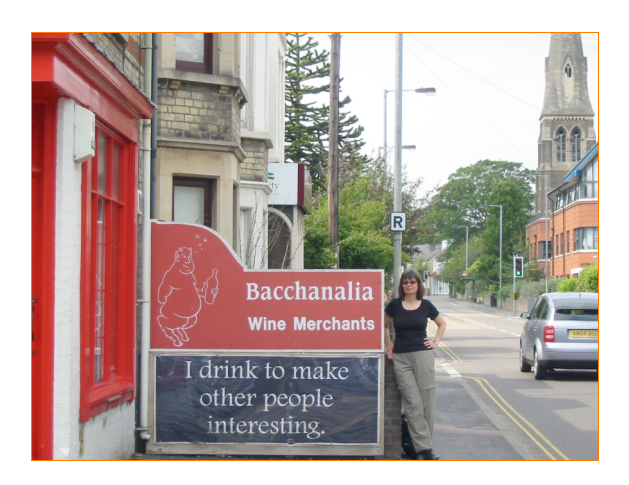
Holly Grasps a Basic Truth About Herself

We wish you the very best that 2010 can bring!