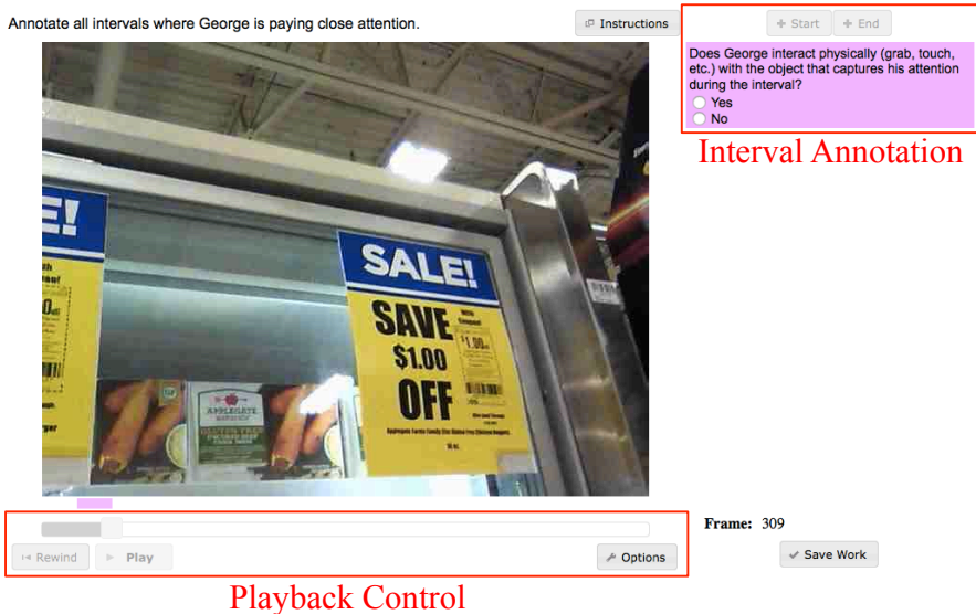
Fig. 1. Screen shot of annotation interface.