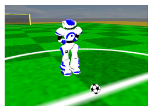
Figure 2: Simulated Nao agent.

The RoboCup 3D simulation league uses the SimSpark [2] multi-agent simulator, which was designed by the RoboCup initiative. SimSpark uses the Open Dynamics Engine (ODE) to simulate rigid body dynamics, including collision detection. Although ODE provides a realistic simulation of physics, it does make several approximations. For example, there is no friction model on hinges in ODE, and so no friction acts on the simulated robot's joints [1].