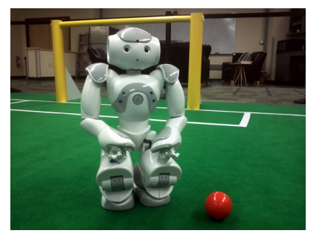
Figure 1: Aldebaran Nao.

In order to validate GSL, we implemented and tested it on a concrete, challenging robot task, namely fast biped locomotion on an Aldebaran Nao robot, shown in Figure 1. The Nao is a humanoid robot that stands a little more than half a meter tall. It has twenty-five degrees of freedom, eleven of which are in the pelvis and legs. In addition, the Nao has proprioception of all joints, pressure sensors on its feet, two gyrometers, and an accelerometer.