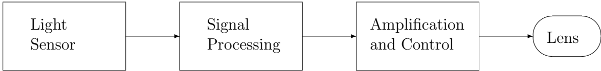
Figure 2: Block Diagram