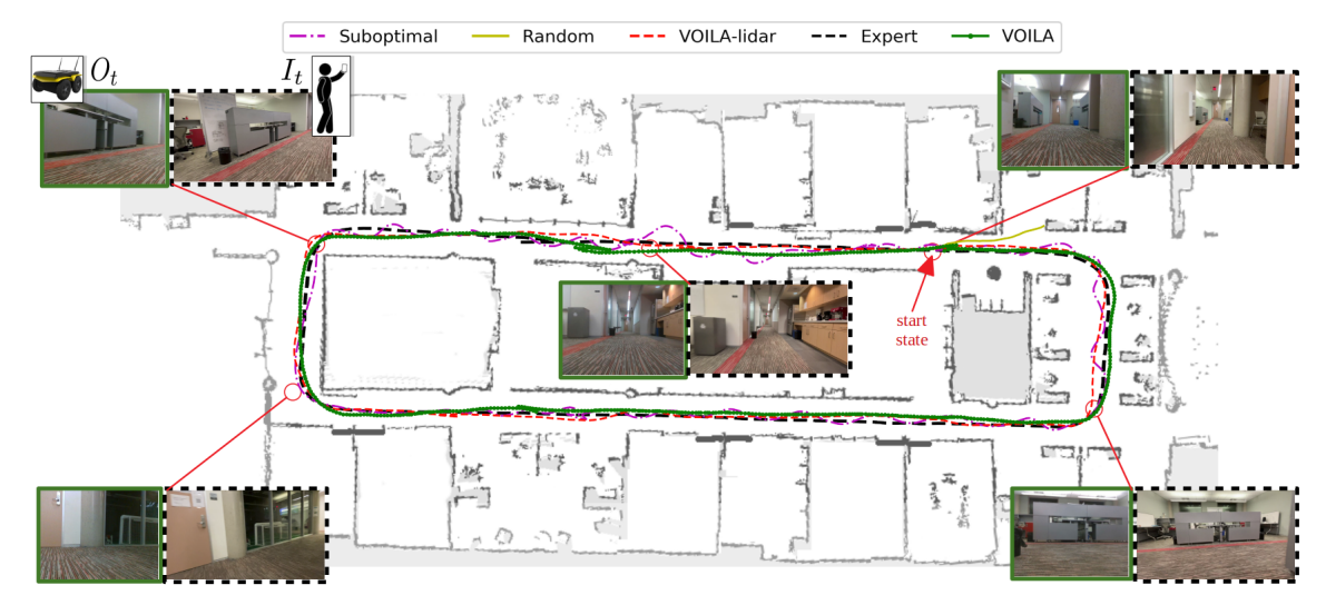
Fig. 1: Policy rollout trajectories of the VOILA agent (green) successfully imitating a demonstration behavior (black) of patrolling a rectangular hallway clockwise. The demonstration consists of a video gathered by a human walking while using a handheld camera that is considerably higher than the robot's camera (introducing significant viewpoint mismatch). We see that the VOILA agent is able to successfully imitate the expert demonstration even in the presence of this egocentric viewpoint mismatch.

the-shelf keypoint detection algorithms that are themselves designed to be robust to egocentric viewpoint mismatch. This novel reward function is utilized to drive a reinforcement learning procedure that results in navigation policies that imitate the demonstrator.