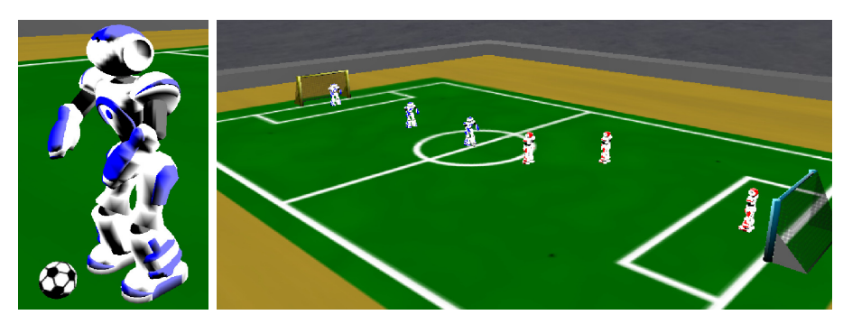
Figure 1. On the left is a screenshot of the Nao agent, and on the right a view of the soccer field during a 3 versus 3 game.

Since 2007 was the year the humanoid was introduced to the 3D simulation league, the major thrust in agent development thus far has been on developing robotic skills such as walking, turning, and kicking. This has itself been a challenging task, and is work still in progress. High-level behaviors such as passing and maintaining formations are beginning to emerge, but at this stage, they play less of a role in determining the quality of play when compared to the proficiency of the agent's skills.