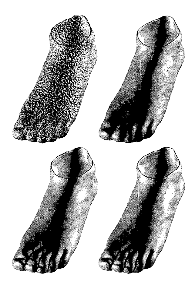
Fig 4.1: The left top figure is the initial geometry mesh. The right top figure is the faired mesh after 3 fairing iterations with uniform timestep t = 0.0011. The left and right figures in the bottom row are the faired meshes after 3 fairing iterations with adaptive timestep and alternatively adaptive diffusion tensor with uniform timestep \tau_i = 0.025 , respectively.

We have proposed two simple adaptive approaches in solving the diffusion PDE by the finite element discretization in the spatial direction and the semi-implicit discretization in the time direction, aiming to solving the under-fairing/over-smooth problems that beset the uniform diffusion schemes. The implementation shows that the proposed adaptive schemes work very well.