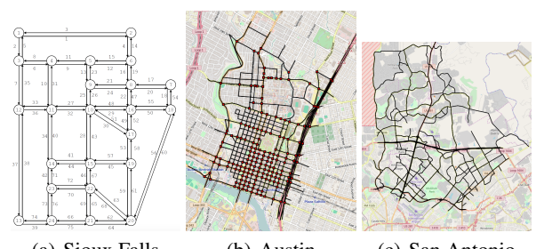
(a) Sioux Falls(b) Austin(c) San AntonioFigure 1: Traffic scenarios used in the experiments.