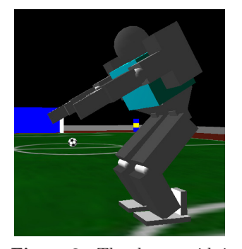
Figure 3. The humanoid is more stable when bent forward.

We found that the robot is much more stable while performing skills like walking and turning if it is bent slightly forward (as shown in Figure 3) than it is standing bolt upright. We maneuver the robot into such a position right at the start of the simulation, before it can start executing any of its skills. We elaborate on the agent's skills in section 4.