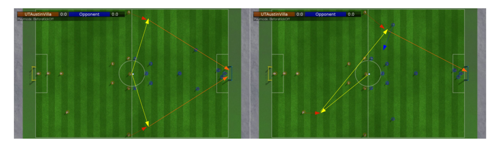
Fig. 2: Kickoff set play to the sides (left image) and pass backwards (right image). Yellow lines represent passes and orange lines represent shots. Dashed lines represent agent movement (red for teammates and blue for opponents).

backwards pass then kicks the ball forward and across to the other side of the field where a teammate is waiting for a pass. It is expected that the player who receives the second pass will be in a good position to take a shot on goal as opponent agents will have been drawn to the other side of the field after the initial backwards pass off the kickoff.