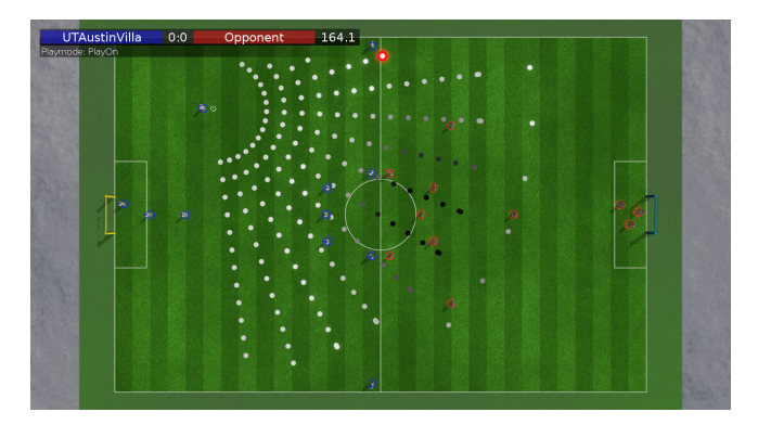
Fig. 1: Potential kick target locations with lighter circles having a higher score. The highest score location is highlighted in red.

Having many available targets to kick the ball to for passing was very important for implementing a keepaway task for the free challenge discussed in Section 5.3. Having accurate variable distance kicks was also imperative for doing well during the kick accuracy challenge described in Section 5.2.