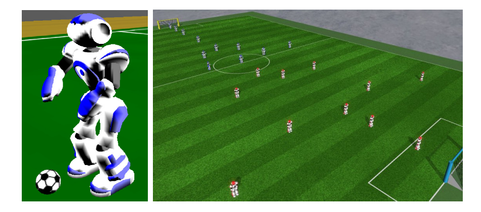
Fig. 1: A screenshot of the Nao humanoid robot (left), and a view of the soccer field during a 11 versus 11 game (right).