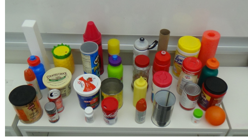
Figure 2: Objects explored via interaction behaviors and for which we have sparse predicate annotations.

In previous work, decisions about a predicate and an object are made for each sensorimotor context (a combination of a behavior and sensory modality) with an SVM using the feature space for that context (Thomason et al., 2016). A summary of sensorimotor contexts is given in Table 1.