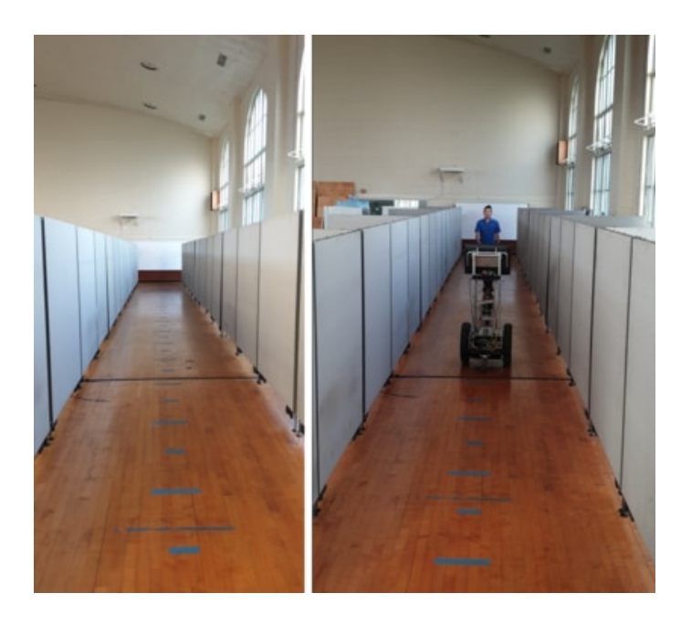
Fig. 2. The hallway constructed for this experiment (left) and a snapshot of the experiment during execution (right).

head. The head turn takes 1.5 seconds. These timings and angles were hand-tuned and pilot tested on members of the laboratory. The gaze signal can be seen in Figure 4 (left).