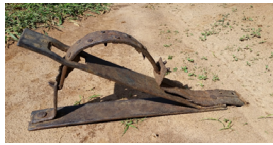
Figure 1: Snare poaching

Example 1. Consider a ranger protecting a large area with rhinos. The area is divided into two subareas N_1 and N_2 of the same importance. The ranger chooses a subarea to guard every day and she can stop any snaring by poachers in the guarded area. The ranger has been using a uniform random strategy throughout last year. So for this January, she can choose to continue using the uniform strategy throughout the month, catching 50% of the snares. But now assume that the poachers change their strategy every two weeks based on the most recently observed ranger strategy. In this case, the ranger can catch 75% of the snares by always protecting N_1 in the first two weeks of January, and then switching to always protecting N_2 : At the beginning of January, the poachers are indifferent between the two subareas due to their observation from last year. Thus, 50% of the snares will be placed in N_1 and the ranger can catch these snares in the first half of January by only protecting N_1 . But after observing the change in ranger strategy, the poachers will switch to only putting the snares in N_2 . The poachers’ behavior change can be expected by the ranger and the ranger can catch 100% of the snares by only protecting N_2 starting from mid-January. (Of course the poachers must then be expected to adapt further).