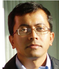
& multicore computing.